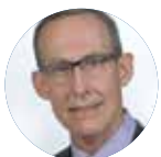
King, Graham Canada